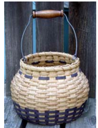
Who can resist a bean pot basket?