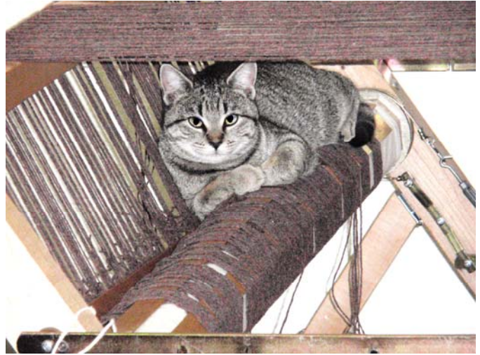
Tabby the shop cat