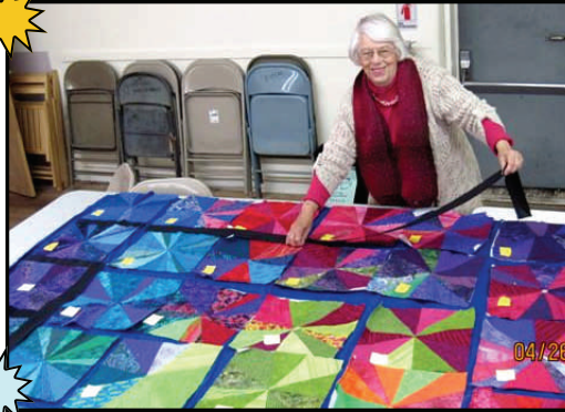
A team of dedicated members put together this gorgeous quilt for our fundraiser - raffle tickets are $25 and the drawing is Dec 15, 2011!